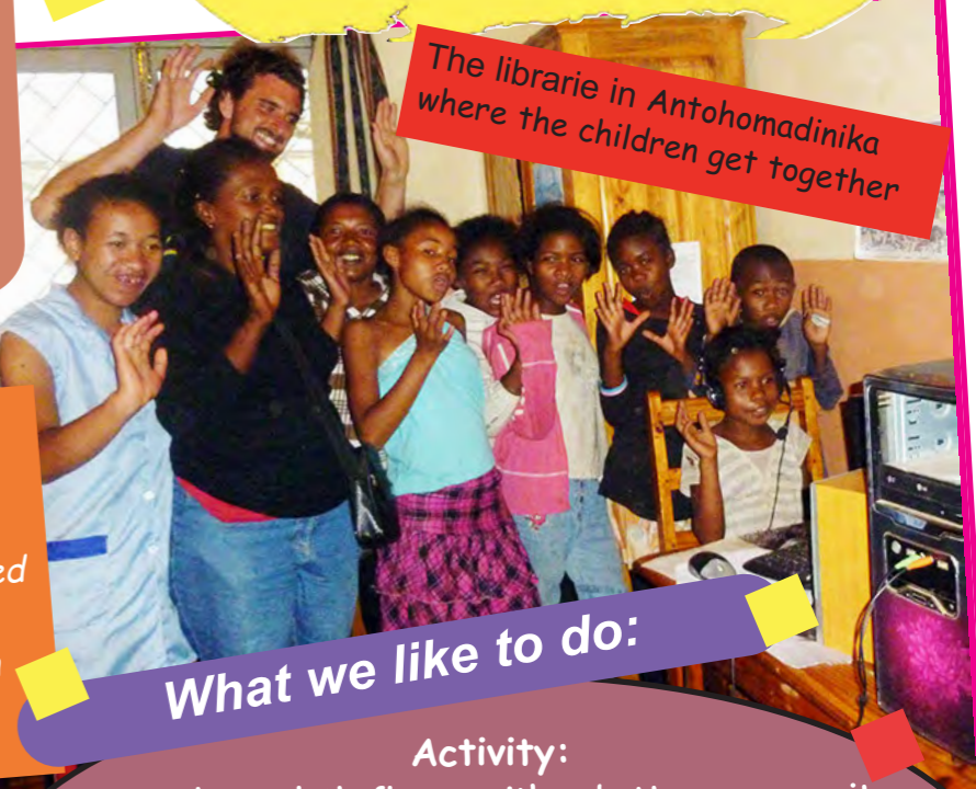
The library in Antohomadinika where the children get together