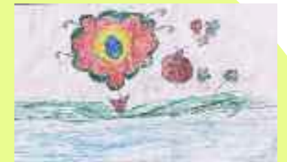
Telah, aged 10