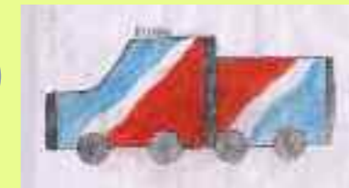
Donne, aged 10