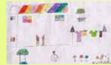
Lydia, aged 10