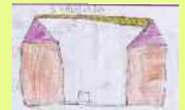
Sandriana, aged 7