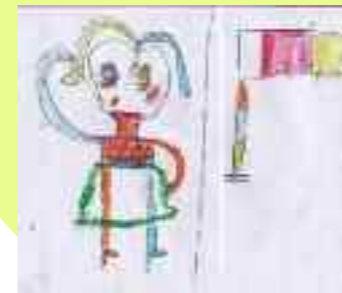
Natasha, aged 10