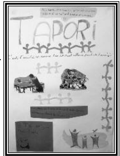
Created by the children during the Week-end Tapori in Switzerland

Send the poster or its photo to the following address :