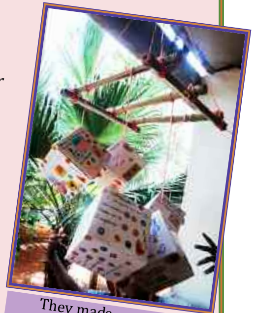
They made a mobile.