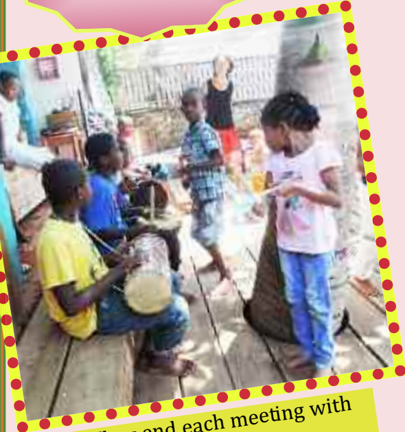
They end each meeting with music.

The children answered the question: “What do you need to be happy in your family?”