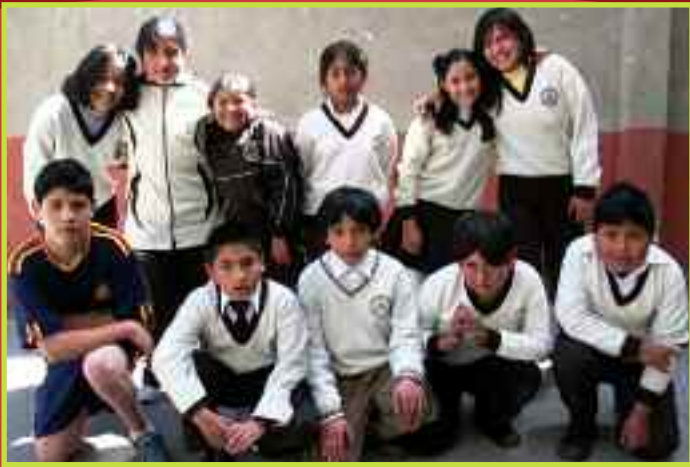
The Páter Noster Tapori Group