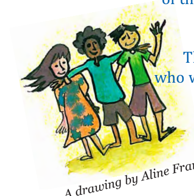
A drawing by Aline France

The group is run by a few adults and some young people who were Tapori members themselves when they were younger. The children answered three questions at their last weekends: