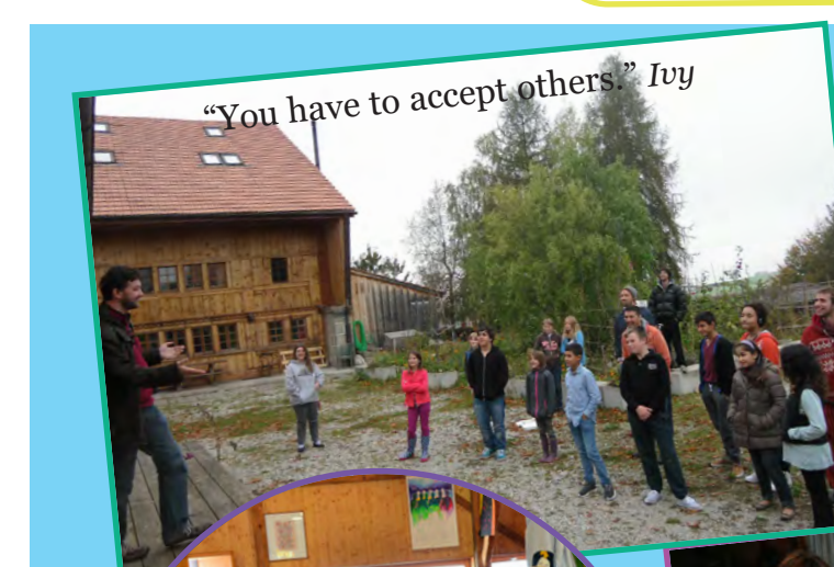
"You have to accept others." Ivy

2. What do you do during Tapori weekends?