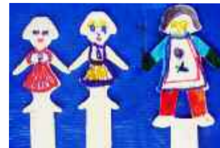
Bookmarks made by children from the Philippines

Ladyslas, aged 8 Democratic Republic of the Congo