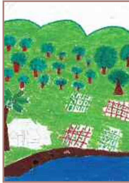
A drawing by child from Philippines