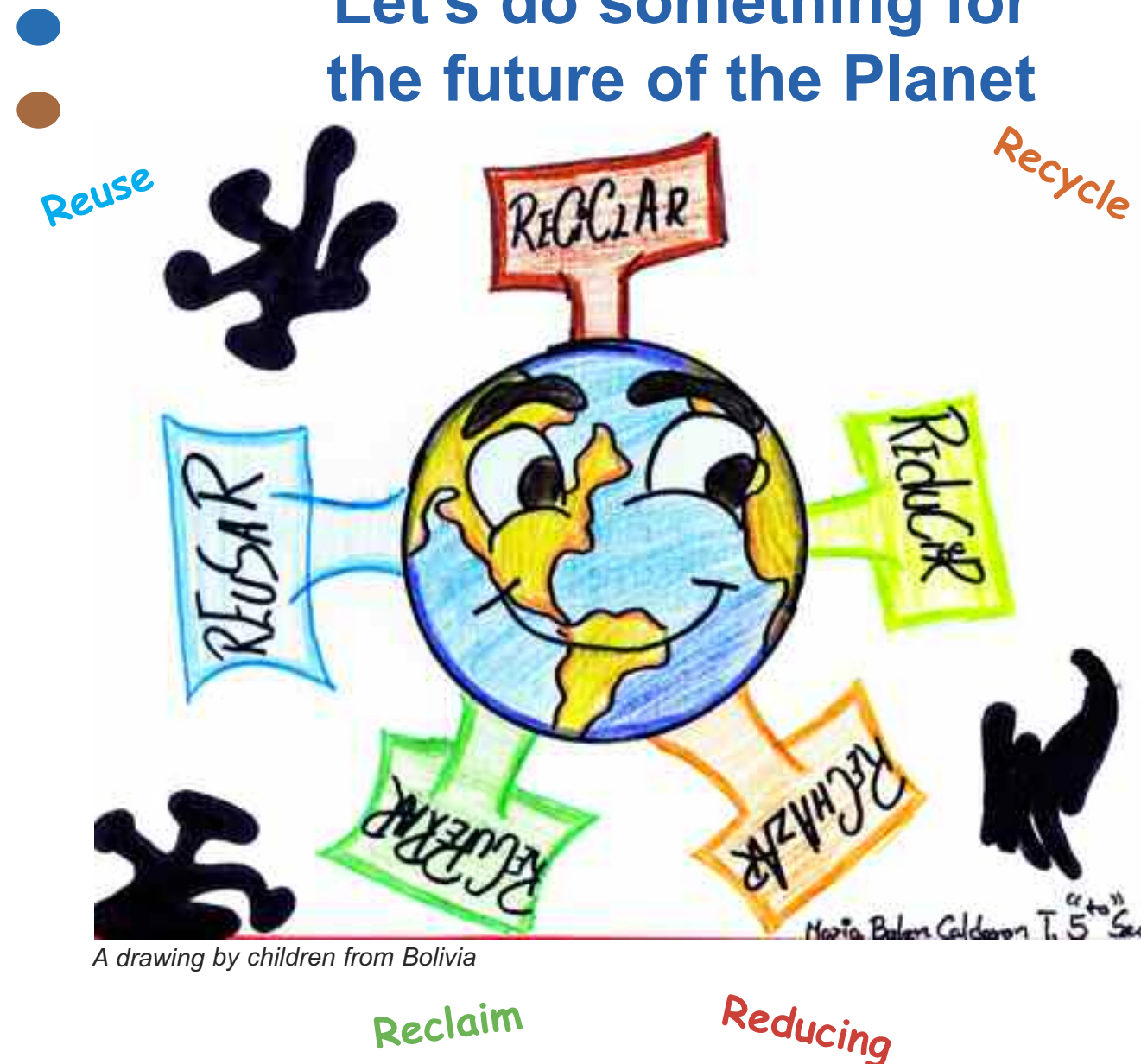
A drawing by children from Bolivia

Let's do something for the future of the Planet