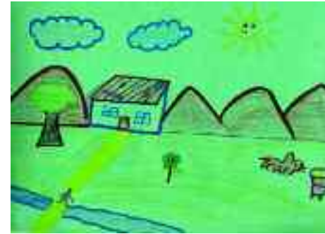
A drawing by children from Bolivia

Let's do something for the future of the planet