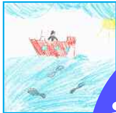
Luka, 8 ans, Croatia