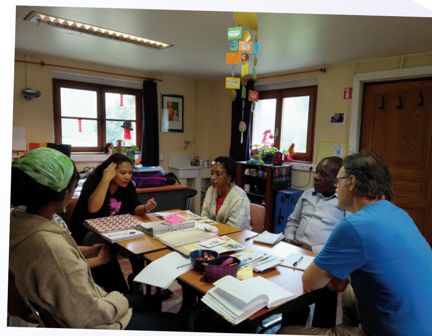
A Tanzanian delegation visiting the offices of the Taporì international secretariat in Méry sur Oise, June 2018,

Publishing the newsletter three times a year will allow facilitators to keep in touch with one another and to share experiences (difficulties faced, successes, questions raised).