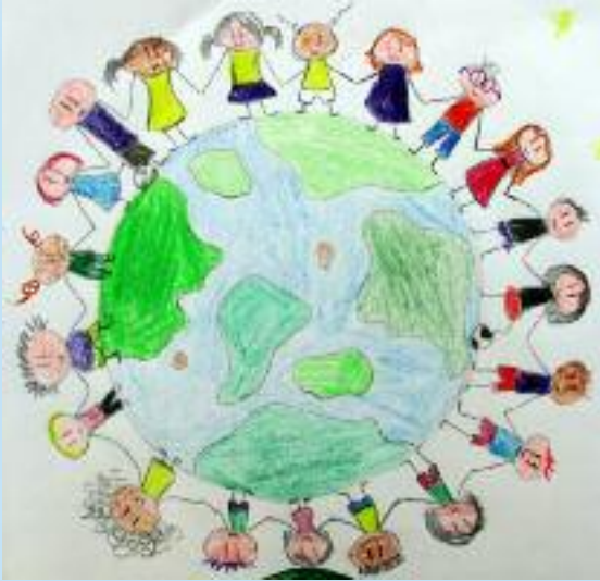
Drawing by a child from Switzerland

Tapori children are between 6 to 13 years old. A child's participation in a Tapori group must always be in agreement with his or her parents or the person responsible for the child (A social worker in some cases).