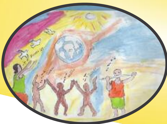
Group Tapori - Fatima Africa

The secretariat is also regularly in contact with adults who run Tapori groups and suggests tools, activities, or training documents to them.